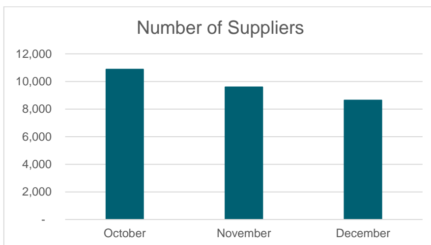
Chart 1 – Number of Suppliers paid October to December 2024