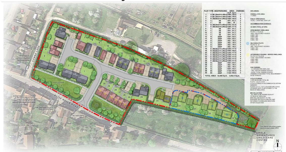
Figure 1: Site Plan

The site is approximately 3 acres of grass land, rising gently from Combe Lane and descending to Little Owls Nursery on its eastern boundary. The site is located to the east of the village of Wedmore on the edge of the village and abuts the development boundary being separated by Combe Lane from the residential settlement at Combe Batch Rise, it is adjacent to Wells road B3139 on its southern boundary. 1