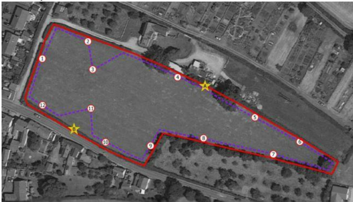
Figure 3: Walked Transect Route (purple dashed line), Stop Points and Static Detector Location (yellow stars)

Typically, the transect surveys, which are poor at recording horseshoe bat activity only logged two passes of Greater Horseshoe bat in any of the transect surveys (2nd September 2019). A total of 29 Greater Horseshoe passes have been recorded by automated detectors, of which 17 were recorded in September at Location A. This species was recorded on every survey at Location A. Clarkson Woods considered that the importance of the application site to foraging Greater Horseshoe bats is likely to be relatively low given that no indication of