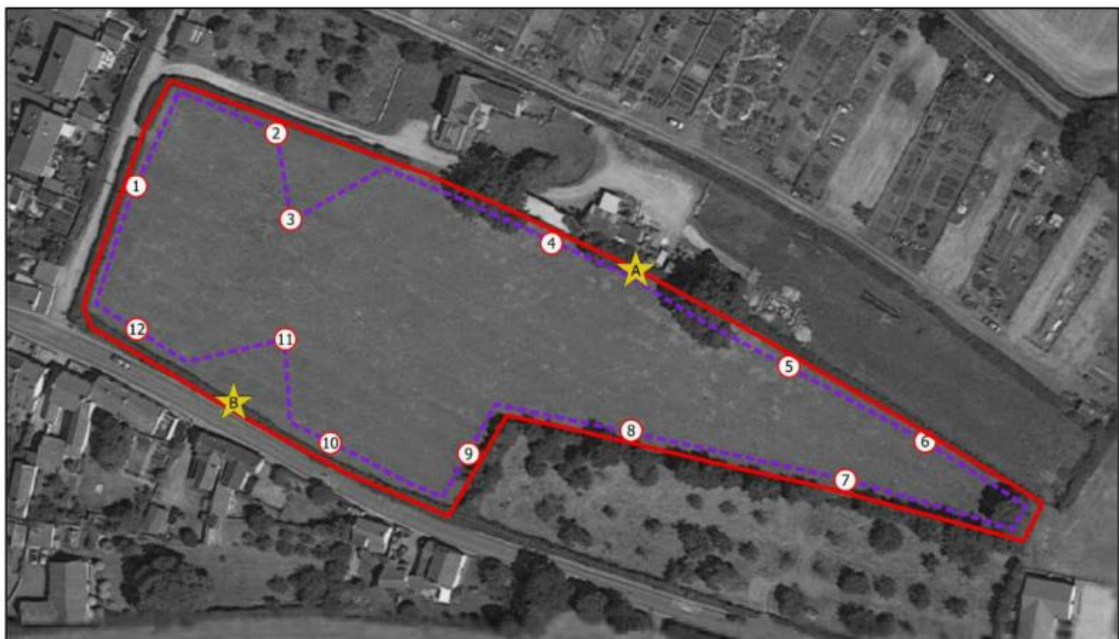
Figure 5: Walked Transect Route (purple dashed line), Stop Points and Static Detector Location (yellow stars) Updates survey (2022)