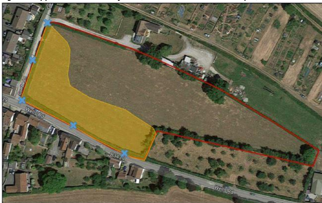
Figure 4: Approximate Lit Area (yellow) and Locations of Streetlamps (blue crosses)

A number of sheds were present along the northern boundary of the application site. These sheds were identified as having 'low' to 'moderate' potential to support roosting bats. All of these sheds were located outside the proposed development site and will be retained.