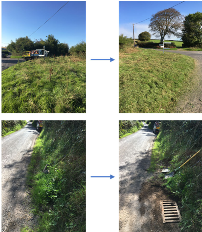
Recent works in Clatworthy