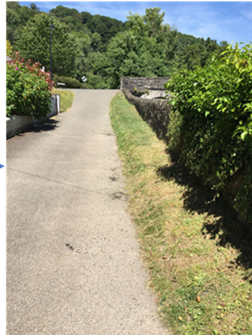
Pound Walk, Dulverton—vegetation management