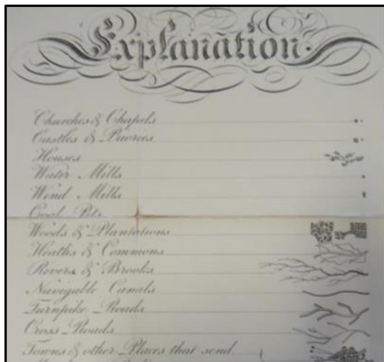
Extract showing the map key