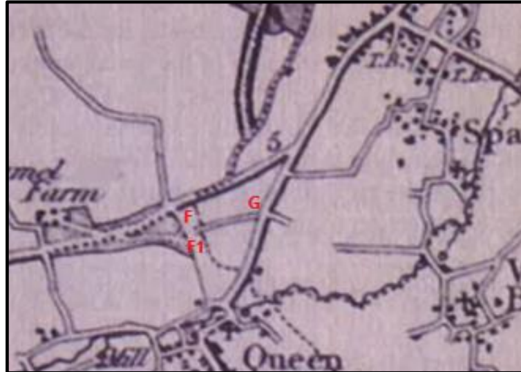
Extract covering application route. Red letters added for reference.