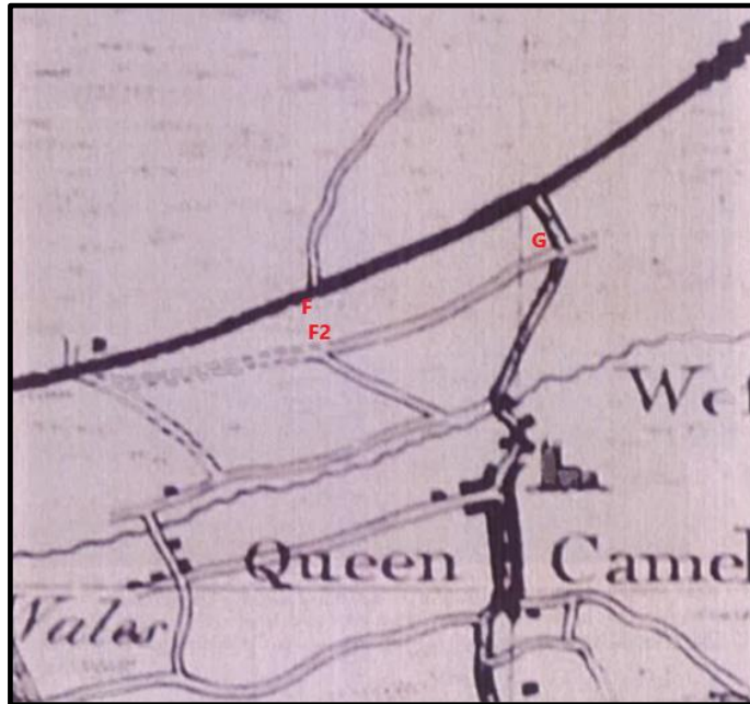
Extract covering application route. Red letters added for reference.