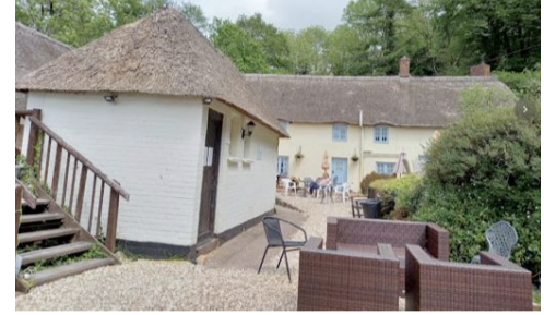
WC's & The Cottages