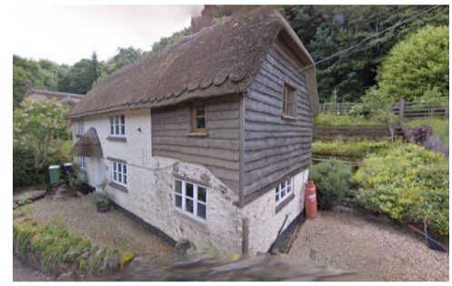
Tally Ho Cottage