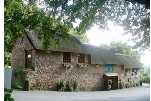
Blue Ball Inn