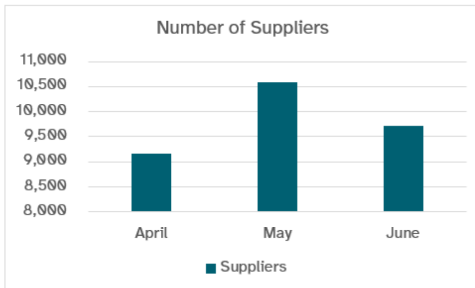
Chart 2 – Number of Suppliers paid April to June 2024