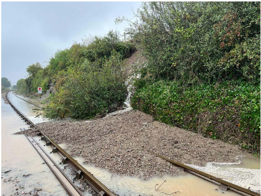
West Somerset Railway line, September 2023

What we cannot know is what exactly is going to happen where and when. We will therefore need to plan and prepare more in ways which explicitly seek to take into account increased uncertainties and unpredictabilities. A more flexible kind of readiness will be required. Programmes of work should ideally be agile enough to allow for different actions to be taken at times when evidence from a changing world and changing climate suggests they will be most effective. Not too early, not too late, but as carefully judged as possible to reduce flood risks, to help people cope with flooding if flooding does occur, and to adapt successfully when need be.