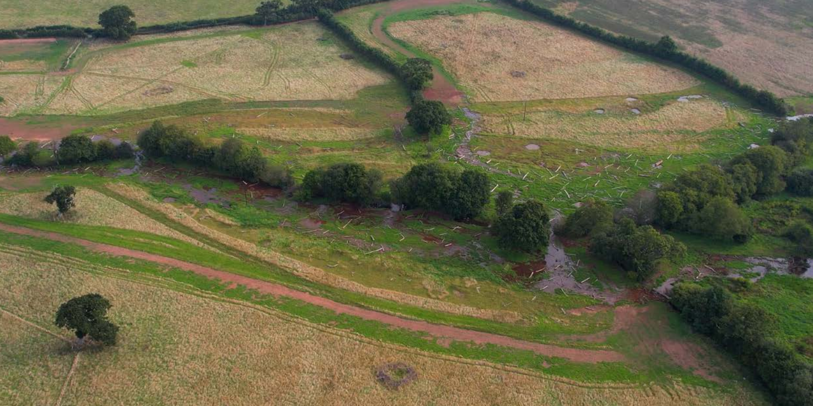
River Aller works