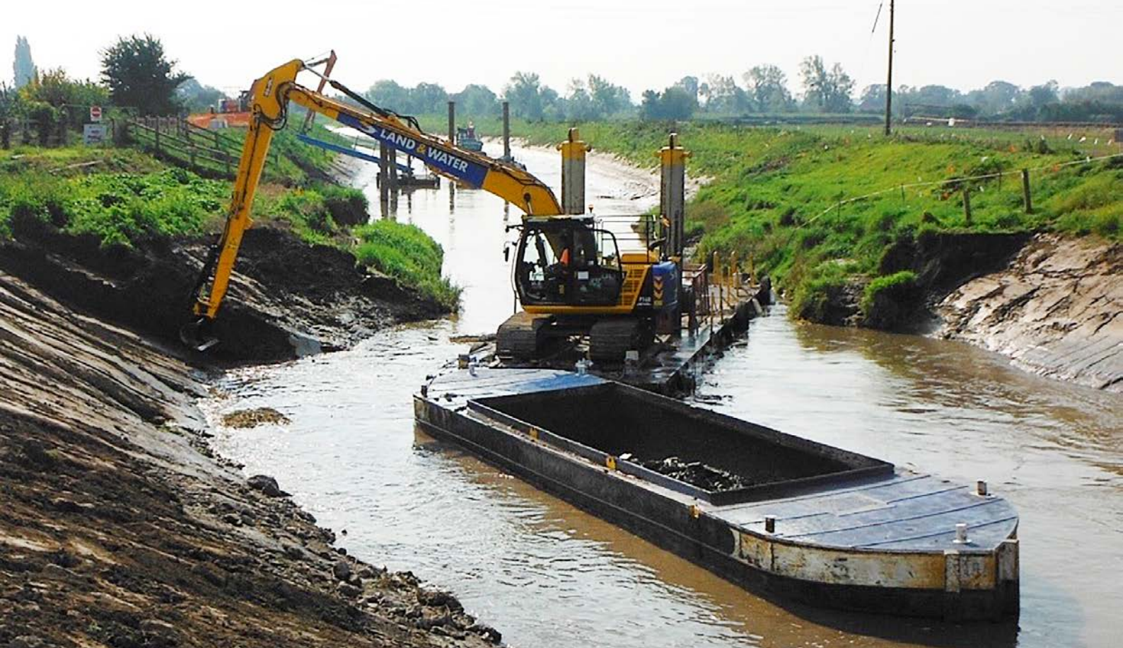
Dredging in 2014

The original Plan made 61 recommendations for actions by a range of different organisations. Some were done very swiftly. For example, in summer 2014, the Environment Agency dredged eight kilometres (five miles) of the River Parrett and River Tone at a cost of £6million. A few months later, Somerset County Council’s Highways Department raised a road at Muchelney, so that people could still get in and out of the village during times of flood. This £2.6million scheme – paid for by the Department of Transport – won a national award. In total, 40 of the Plan’s original recommendations have been completed; 12 are still in progress; nine have not progressed for various reasons (chiefly to do with costs, intrinsic difficulties, problems being addressed in other ways, and better ideas being conceived).