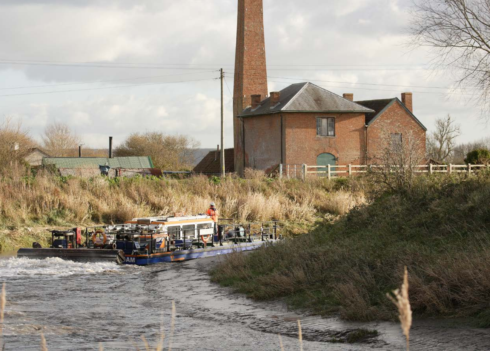
Water injection dredging